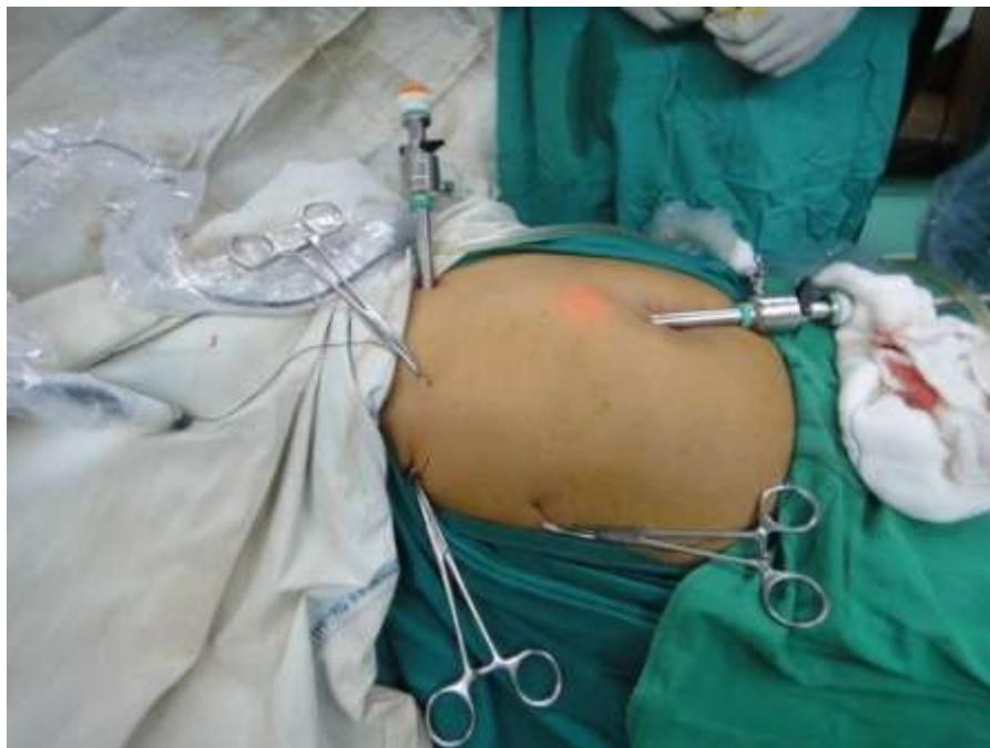
Figure 1 showing trocar and traction suture positions