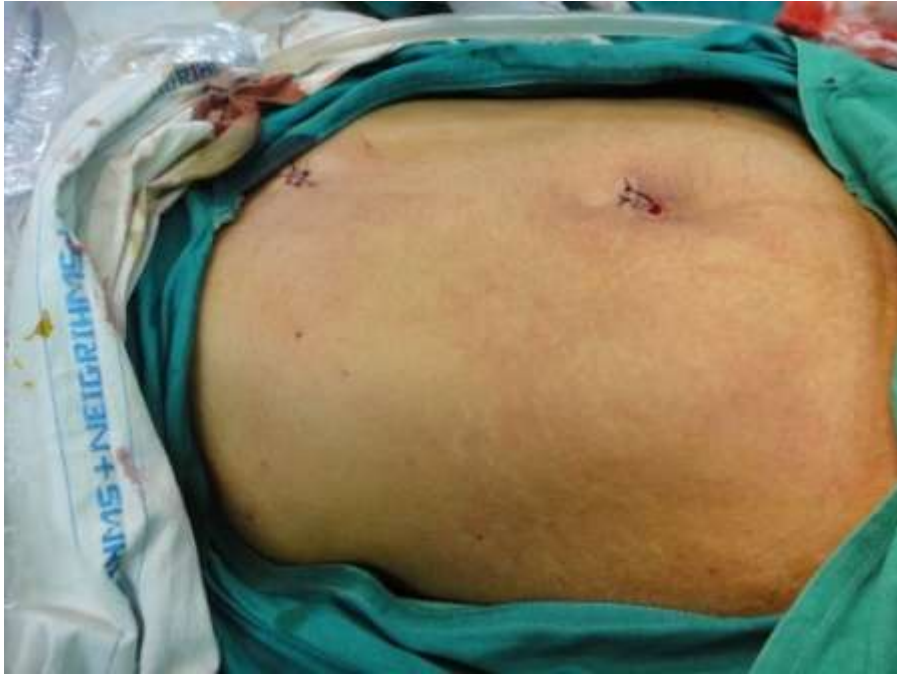
Figure 4 showing postoperative cosmesis.